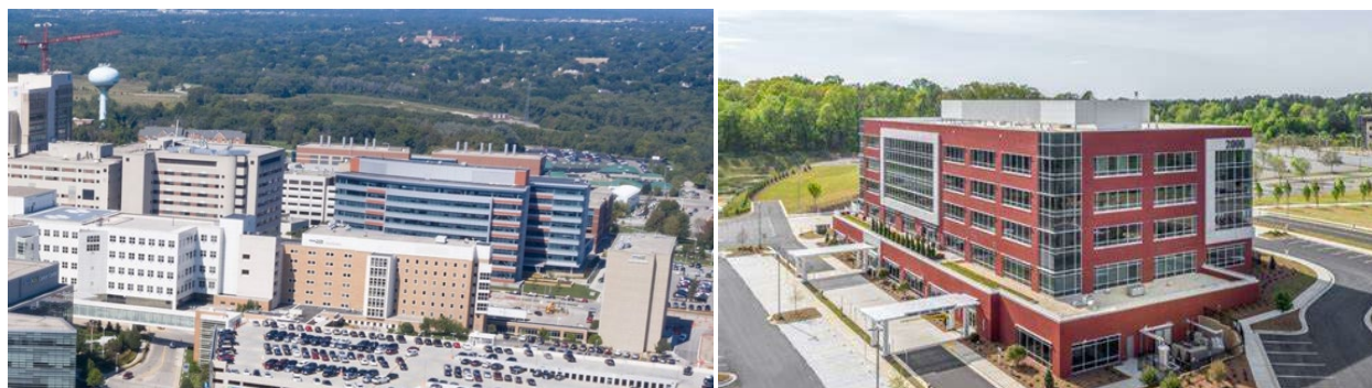
An on-campus MOB (Left) versus an off-campus MOB (Right). Suburban off-campus MOBs could outperform due to lower competition and proximity to patient population.