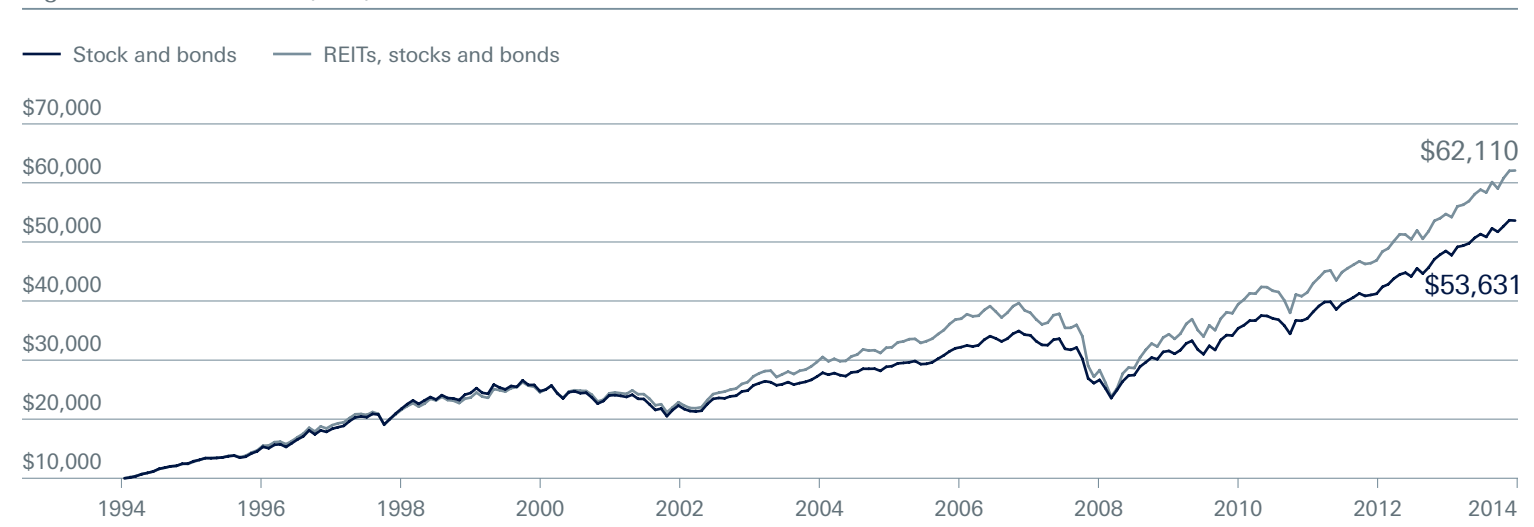
Figure 6: Growth of $10,000, 11/30/94-12/31/14

Performance is historical and does not guarantee future results. Asset-class representation is as follows: REITs, FTSE NAREIT All Equity REITs Index; equities, S&P 500 Index; bonds, Barclays U.S. Aggregate Index. Index returns assume reinvestment of all distributions and do not reflect fees or expenses. Results would have been lower if fees had been deducted. It is not possible to invest directly in an index. See back page for index definitions.